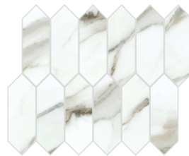
5x15 (2" x 6") 28 x 33 (11" x 13") CALACATTA BORGHINI Picket Mosaics