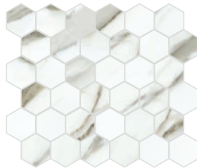
5 x 5 (2" x 2") 28 x 33 (11" x 13") CALACATTA BORGHINI Hexagon Mosaics