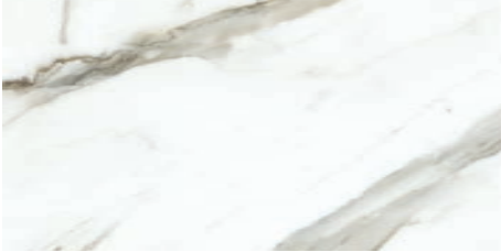
30 x 60 cm (12" x 24") CALACATTA BORGHINI