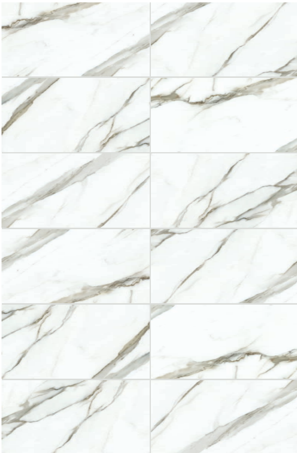
30 x 60 cm (12" x 24") CALACATTA BORGHINI